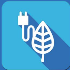
Energy & Environment