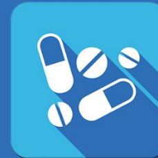
Healthcare & Bio-Sciences