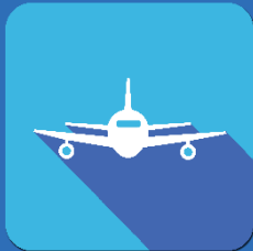
Defense & Aerospace

Prepared for the Washington State Department of Commerce